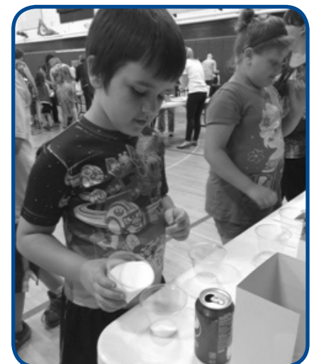
(Below) Students learned about the sugar content in soda.