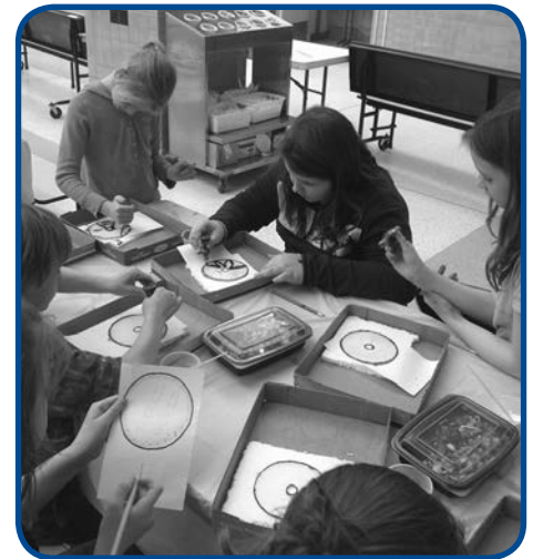
BASE A-3 students participated in an arts program at Alfred University.

The A-3 afterschool program finished another successful year with more than 100 participants. Highlights of the year included a trip to Alfred University for an acoustics program, the Alfred University Stem Challenge and a trip to the planetarium at Corning Community College. We also had visiting guests from the Alfred State Culinary Arts Program and the Wildlife Defenders. We capped off the year with a trip to Syracuse, NY to the WonderWorks Museum. WonderWorks is a hands-on interactive science museum with more than 100 exhibits.