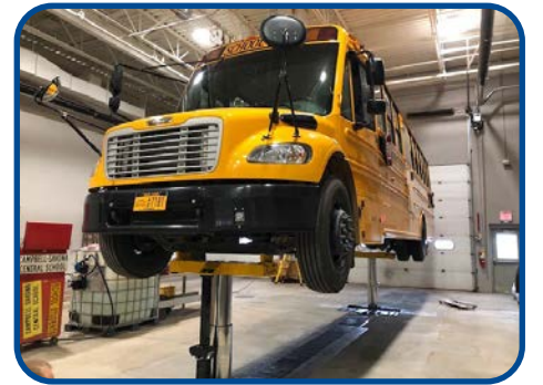
New bus lift