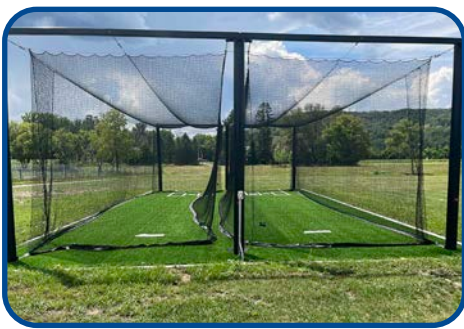
New batting cages