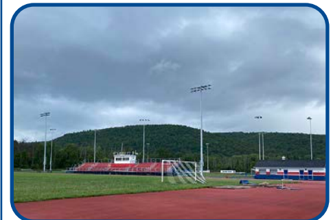
New lights on our athletic fields

C-S school staff and the community will enjoy new lights on our athletic fields, new sidewalks, resurfaced tennis and basketball courts, new windows in both buildings, a bus wash at the bus garage, new fire alarms and clocks in all classrooms and offices and many more enhancements. We are proud of our facilities and strive to keep them updated and safe for all to enjoy.