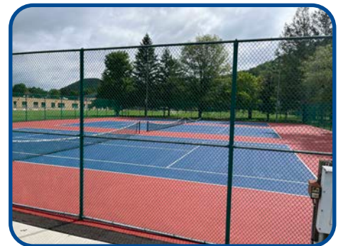
Resurfaced tennis courts