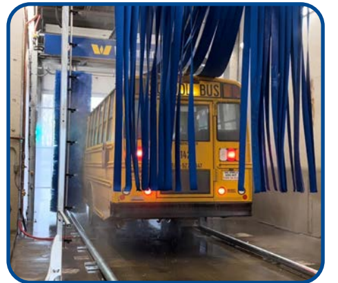
New bus wash